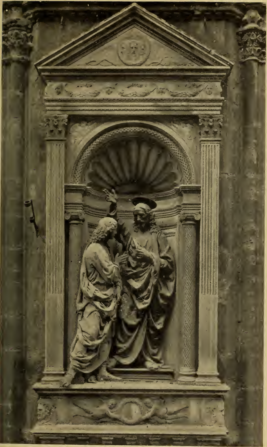
CHRIST AND S. THOMAS